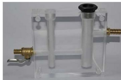
Flow Through Cell with Double Electrode